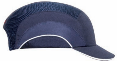
Short Peak (5cm) shown above